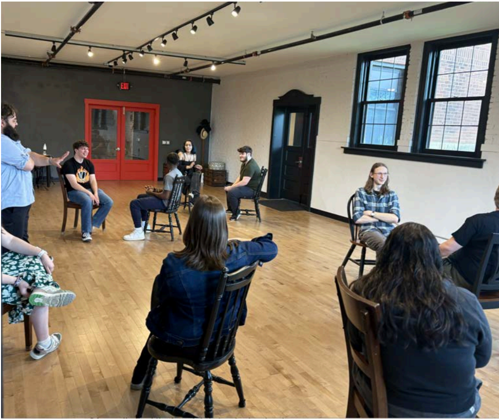
High School students participated in an all-day Theatre LILA retreat, improv class and workshops in Spring 2025.