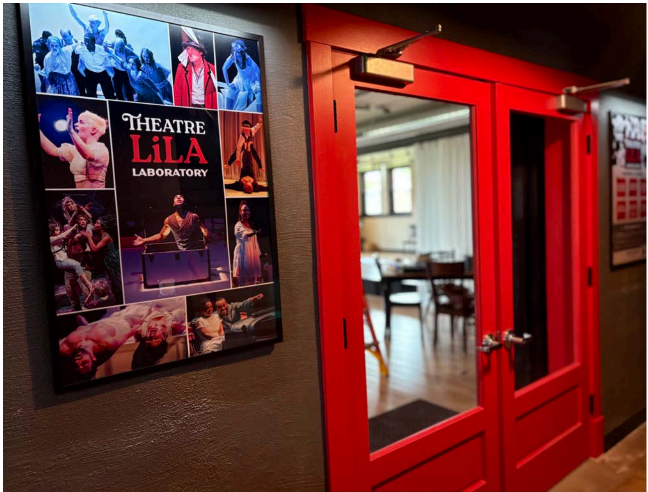
Theatre LiLA Studio