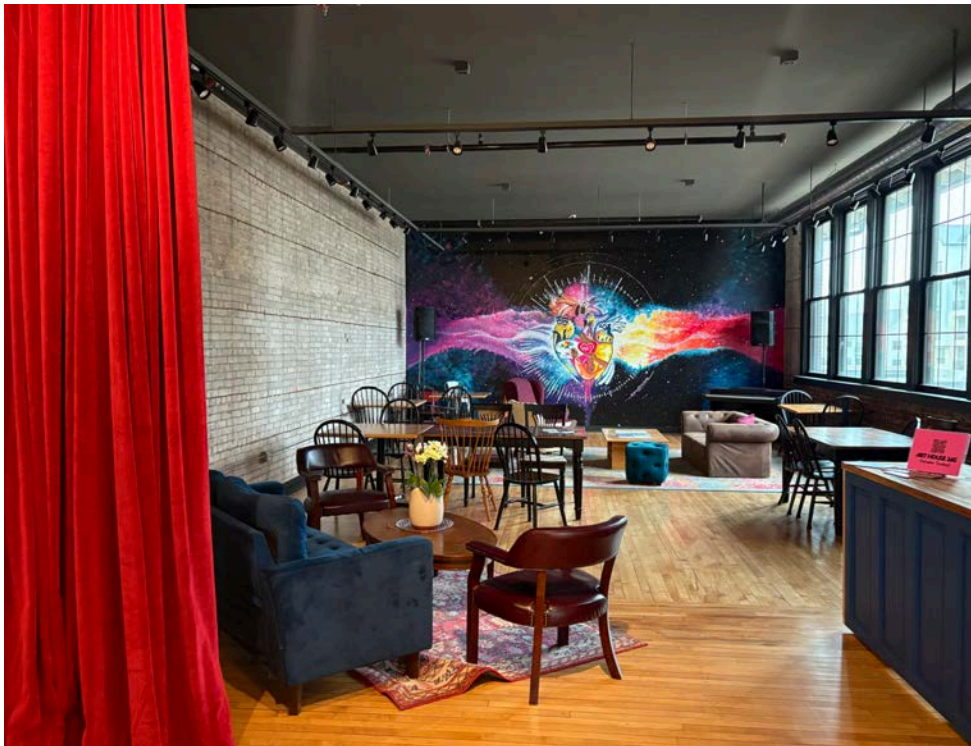
ART House 360 Community Lounge