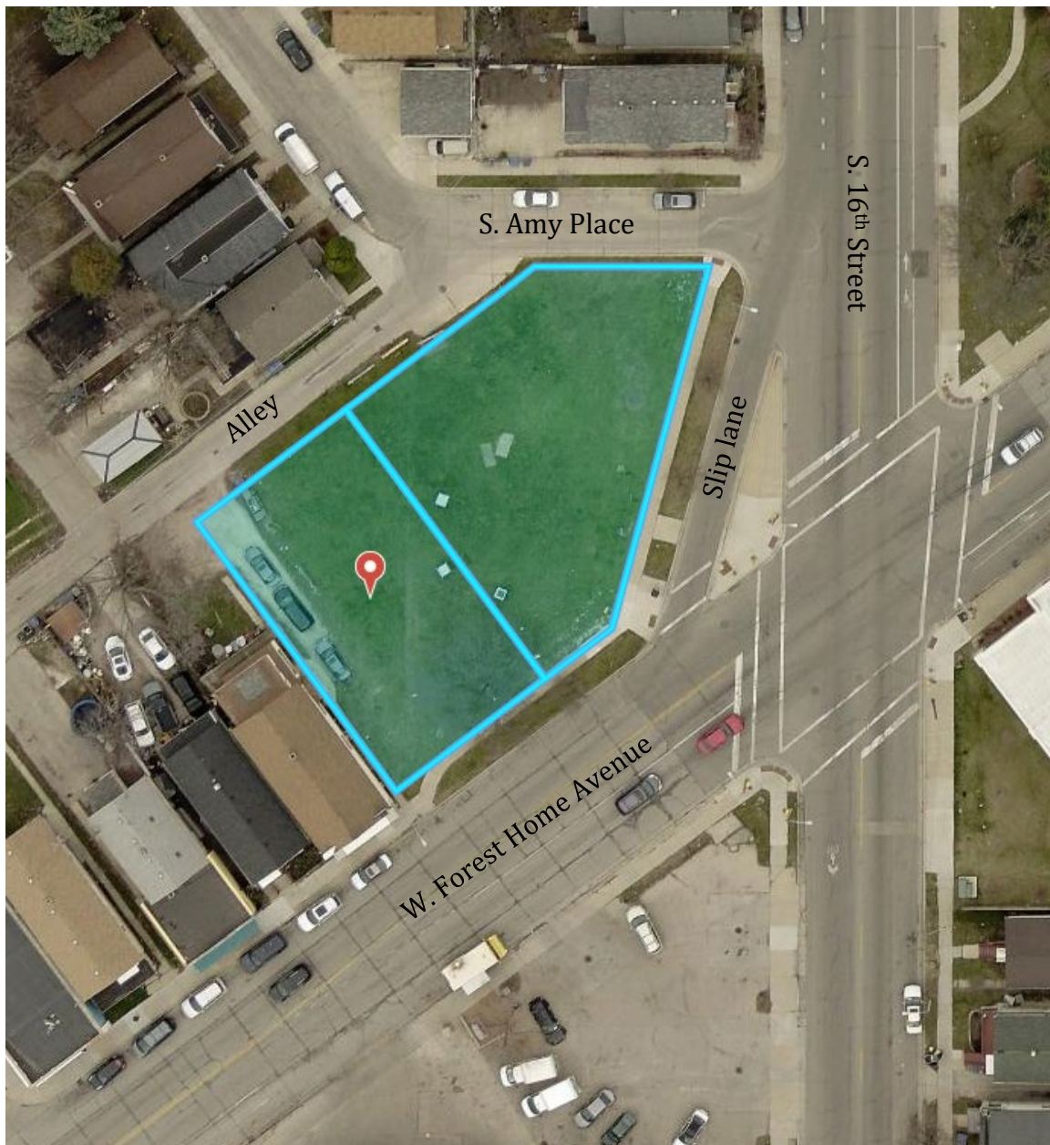
DEVELOPMENT SITE AT 16 TH AND FOREST HOME