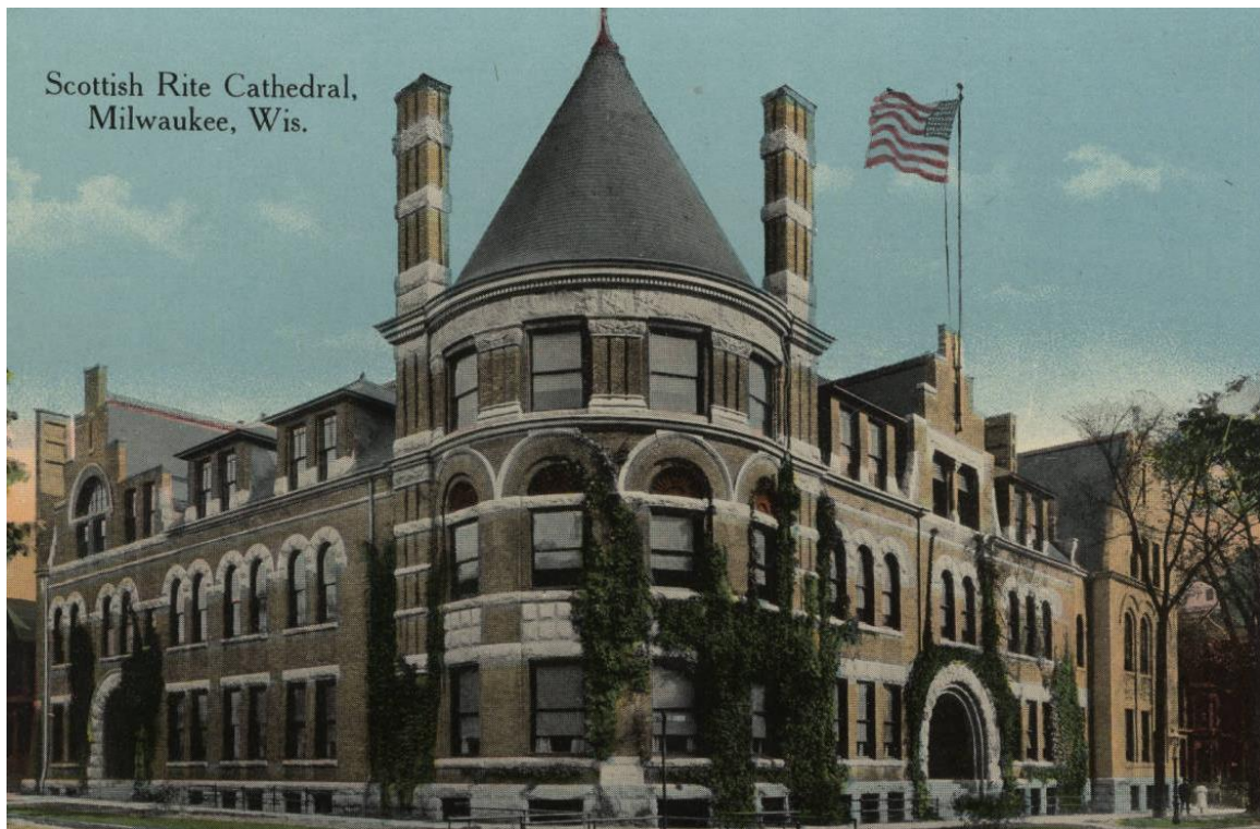
Postcard View after 1912 and before 1937. The 1912 addition shows at the far right.